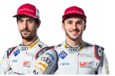
Lucas di Grassi