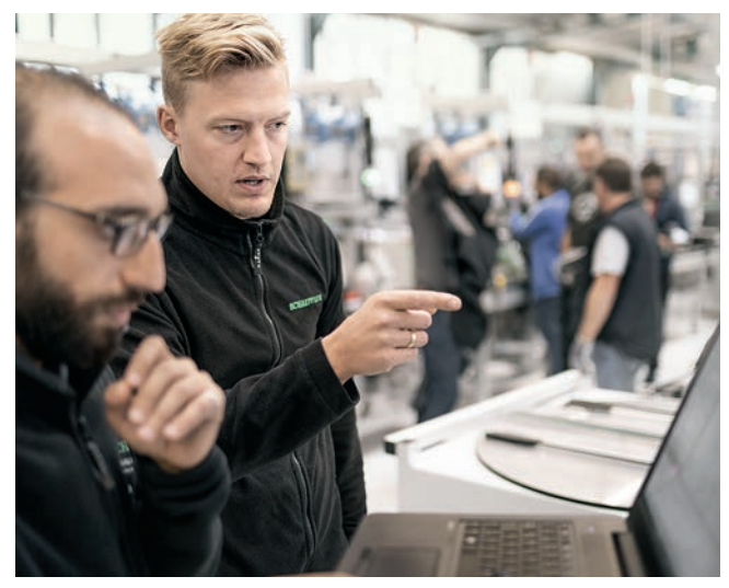
Online condition monitoring ensures safety on offshore drilling rigs

Using the correct tools at installation and removal is an important prerequisite for ensuring long bearing life. To that end, we offer professional tools for bearing mounting and bearing removal, as well as training programs for proper bearing mounting techniques. We can even install the bearings for you! In this case, a team of specially trained Schaeffler technicians can be on site to provide expert assistance when you need it.